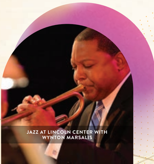
JAZZ AT LINCOLN CENTER WITH WYNTON MARSALIS