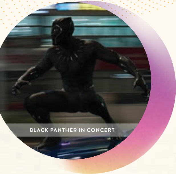
BLACK PANTHER IN CONCERT