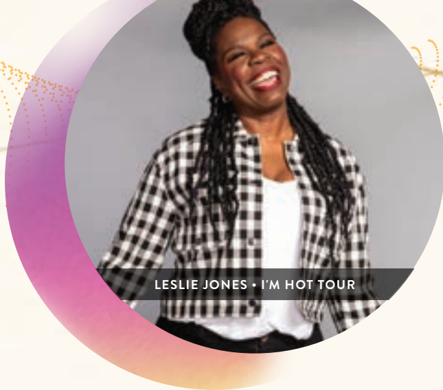
LESLIE JONES • I'M HOT TOUR