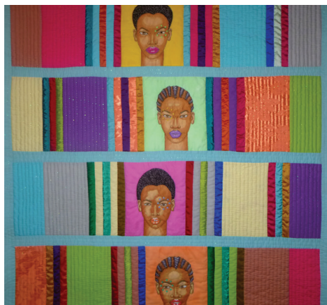
Jim S. Smoote II, Anok , 2022, Hand quilted, acrylic on cotton, silk, fabric, machine pieced cotton, 48 x 45 inches.