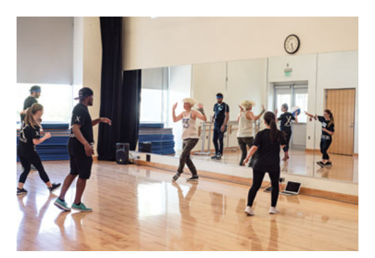
DANCE CLASSES AND WORKSHOPS

Check out our new assortment of Arts Camps for kids including Graphic Arts, Fusing, Jewelry Kids Camps and Hip Hop Camp.