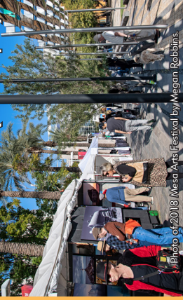
Photo of 2018 Mesa Arts Festival.

Artist information and application mesaartscenter.com/mesaartsfestival