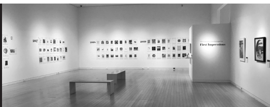
Installation view of the retrospective First Impressions , which featured all the artists who participated in the print calendar project in the last five years, Dec 2018 - Mar 2019.