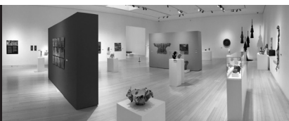
Installation view of MCA Museum's 40 th Annual Contemporary Crafts exhibition, February - April 2019.