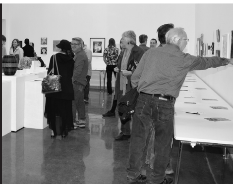
Reception for BidUp Silent Auction Fundraiser , Nov 16, 2018.